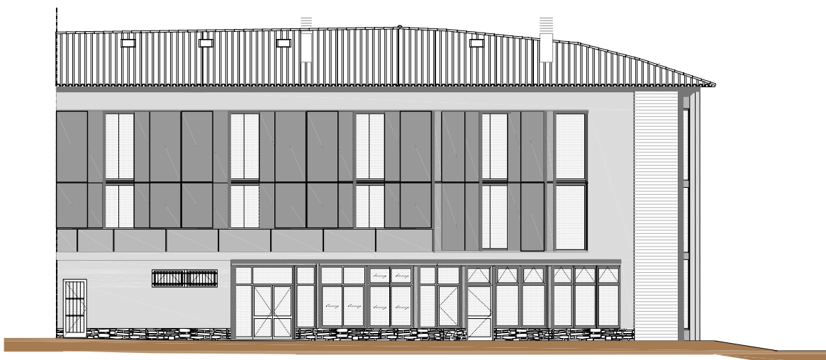
ALÇAT PRINCIPAL 1